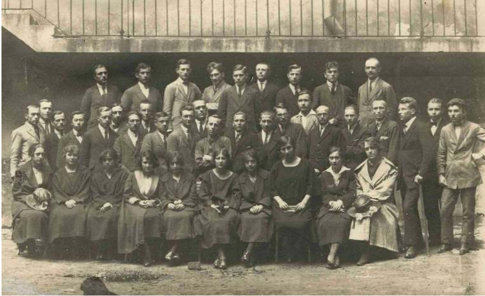
Students of the Philosophical Faculty of the Ukrainian University in Lviv.

later, due to the lack of funding, the term of study in the Faculty of Mechanical Engineering was reduced to one year.