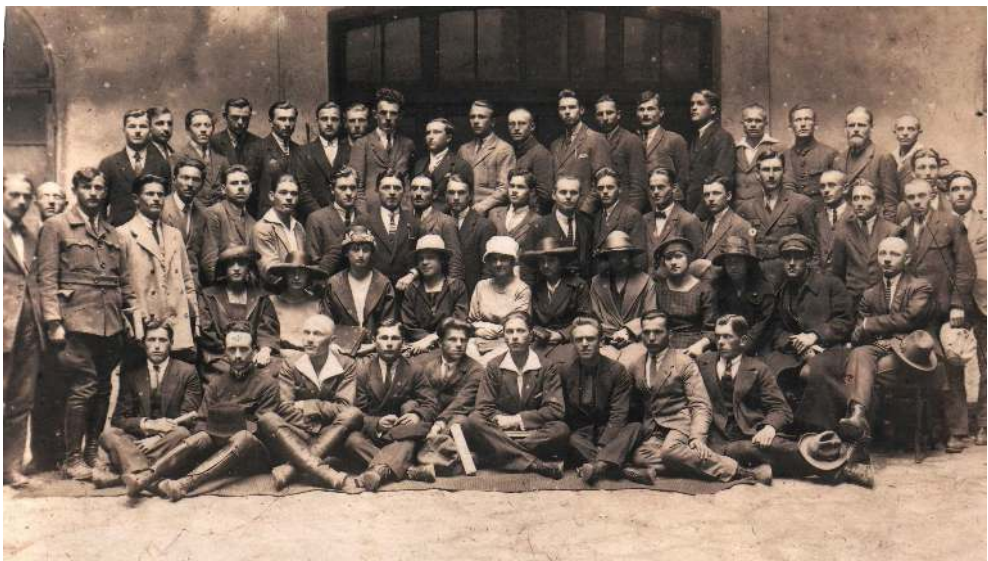
Students of the Medical Faculty of the Ukrainian University in Lviv, 1921.

Despite the police raids, the University didn't stop working. At the end of the first academic year, on May 28, 1922, a meeting of the University Senate was held.